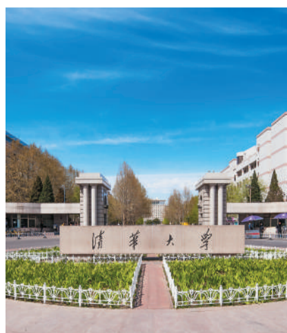
Tsinghua University

the U.S. believe America's science and technology strength could be undermined by toughened U.S. visa requirements that are restricting the flow of academic talent from China.