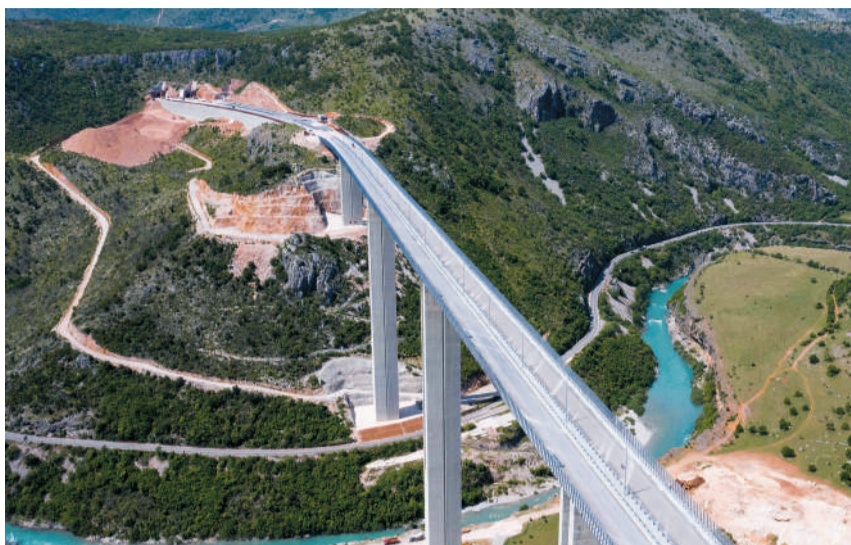
The aerial views of Montenegro's highway built by China.

Journalist Ralph Jennings said on the Voice of America, that green energy is the new focus of China's one-of-a-kind BRI, aiming to build a series of